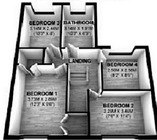
FIRST FLOOR APPROX. 51.5 SQ. METRES (548.9 SQ. FEET)

TOTAL AREA: APPROX. 128.2 SQ. METRES (1379.5 SQ. FEET)